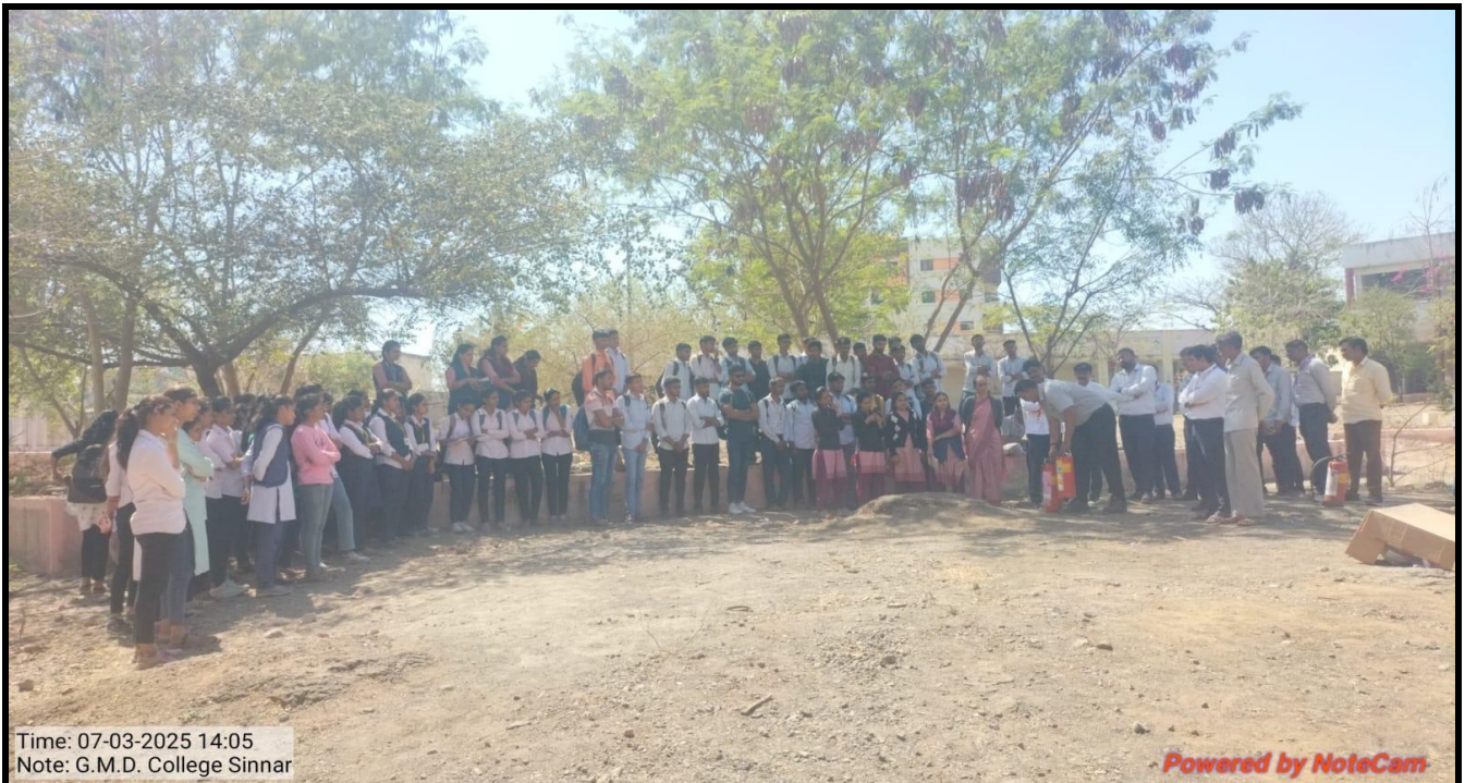
Time: 07-03-2025 14:05 Note: G.M.D. College Sinnar