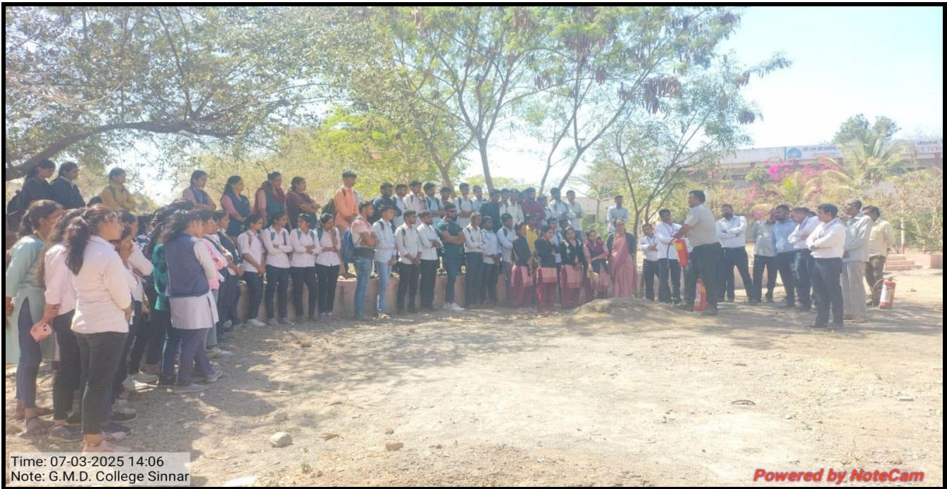
Time: 07-03-2025 14:06 Note: G.M.D. College Sinnar