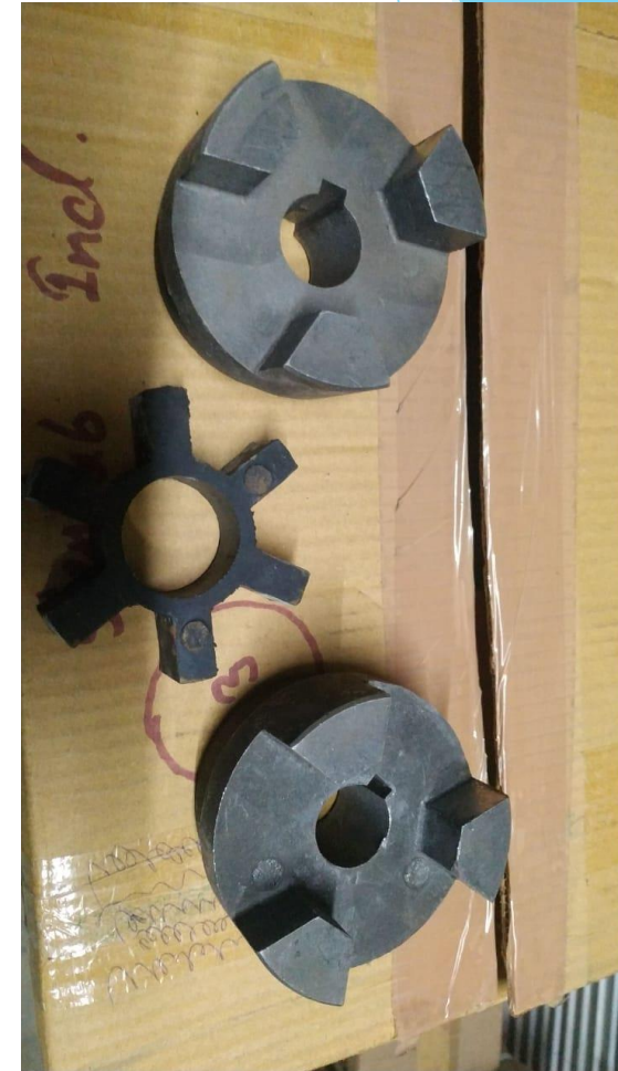
LOVE JAW COUPLING