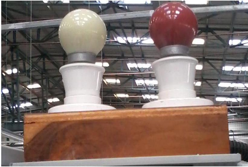
RED & YELLOW LAMP