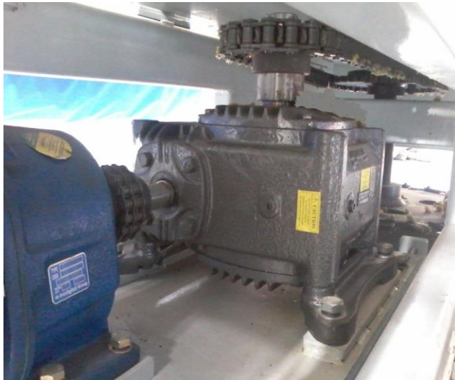
GEAR BOX UNIT