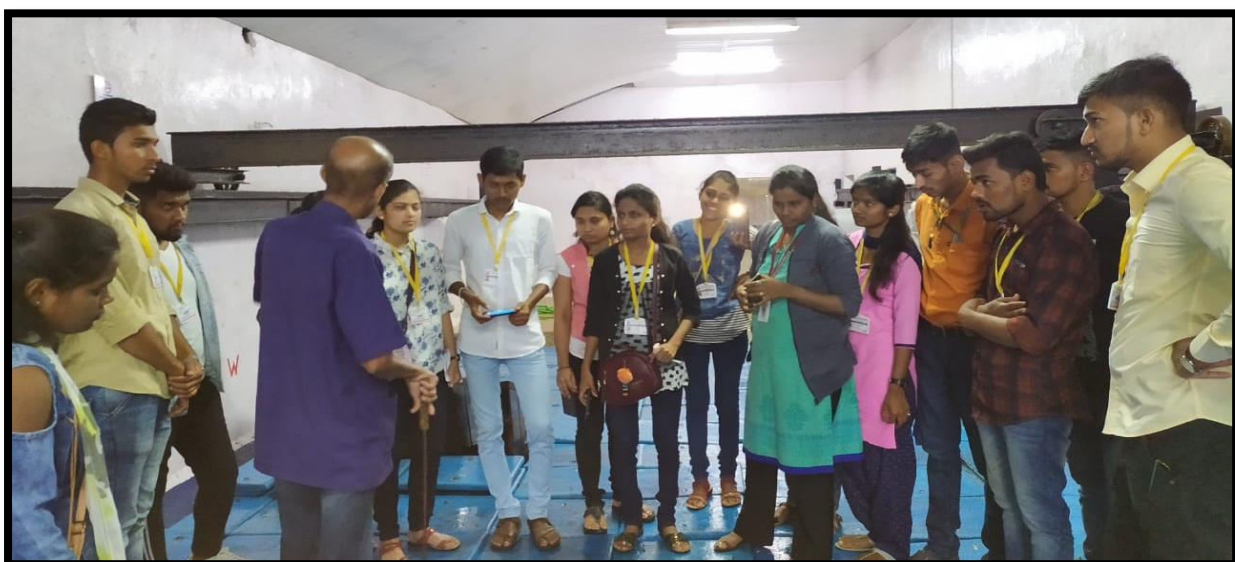
A worker of Amison fisheries giving valuable information to B. Sc. and M. Sc. students.