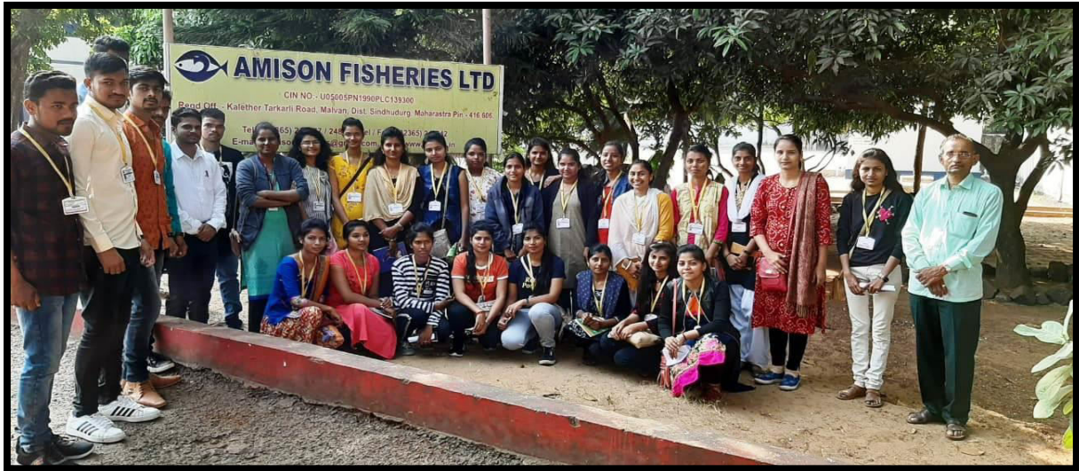
A visit to Amison Fisheries Ltd. at Malvan, District Sindhudurga.