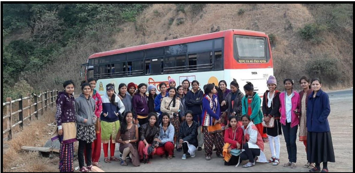
A bus of state transport and the educational tourist of our college at Kokan.