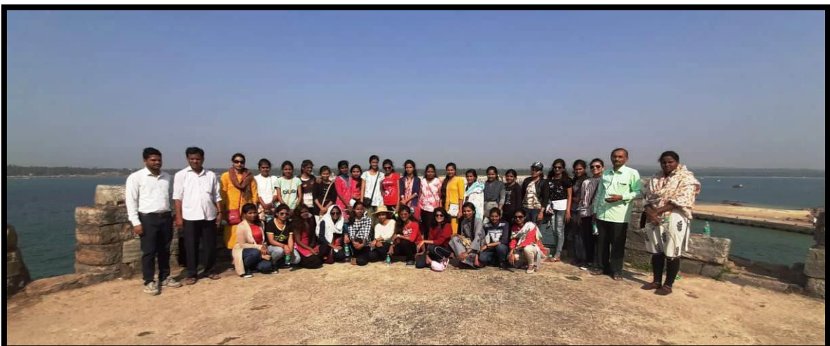
A visit to Sindhudurga fort in the memory of Chatrapati Shivaji Maharaj.