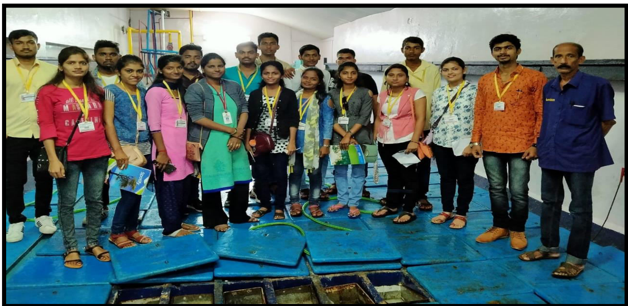
Cold storage of fishes by using ice chambers