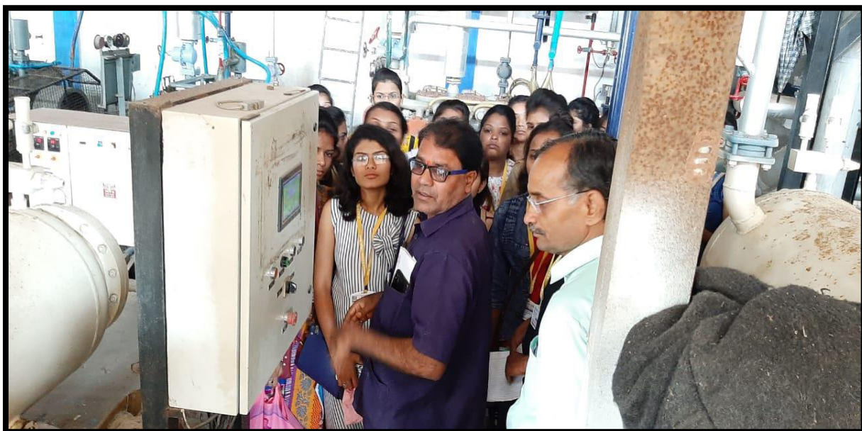
Auto control of use of liquid Ammonia to maintain -40 degree centigrade.