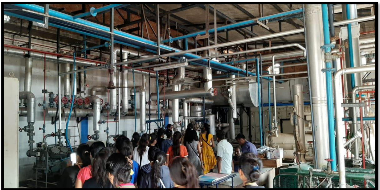
A liquid Ammonia plant for freezing of fishes.