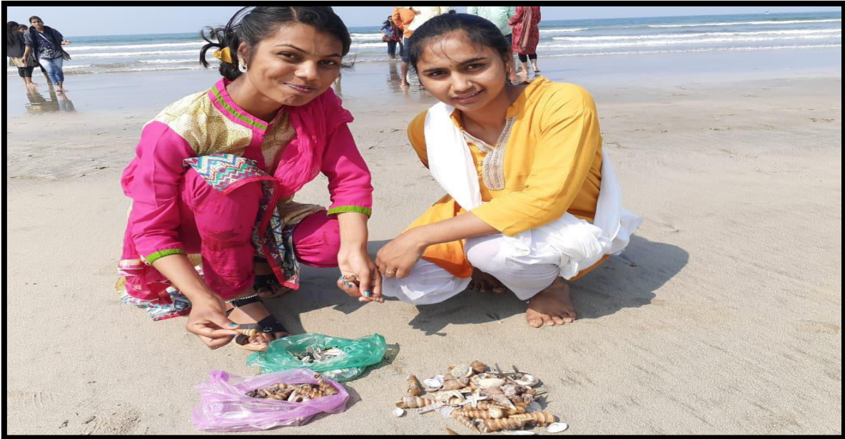
The students collecting various animals' shells at sea shore.