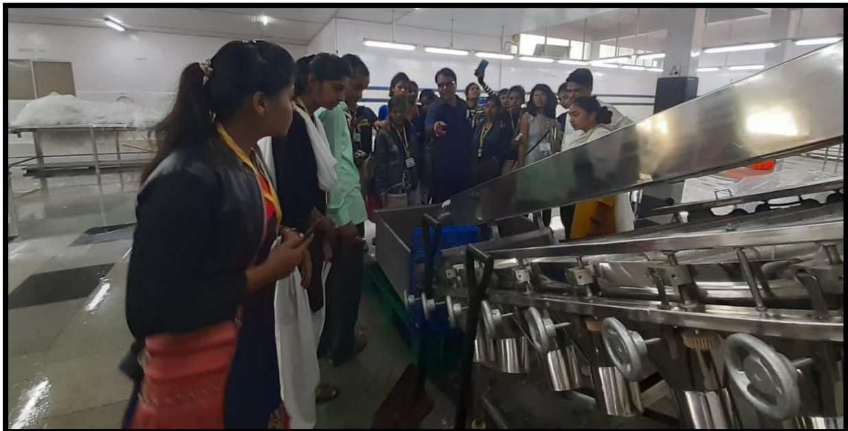
A machinery used to sorting of fishes according to size.