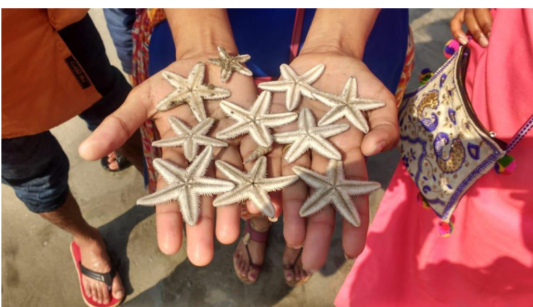
The collection of star fishes, molluscans shell, sea cucumber, oysters at Tarkarli Beach by students.