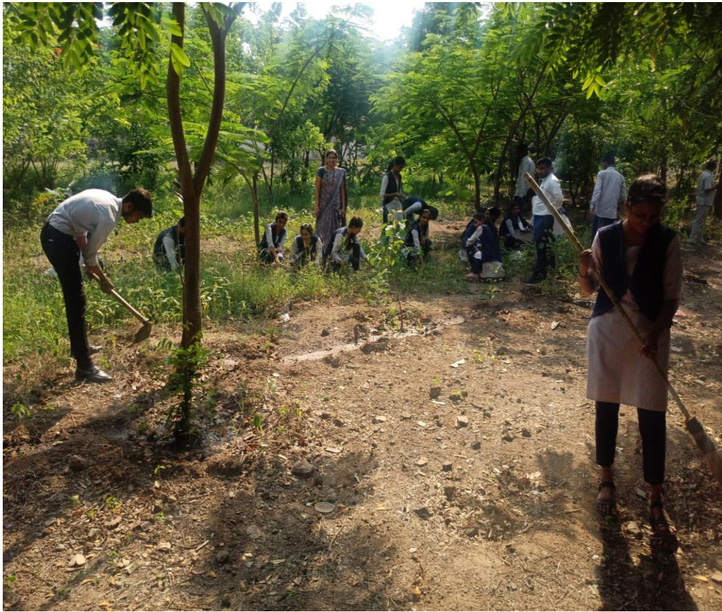
Maintenance in Botanical Garden