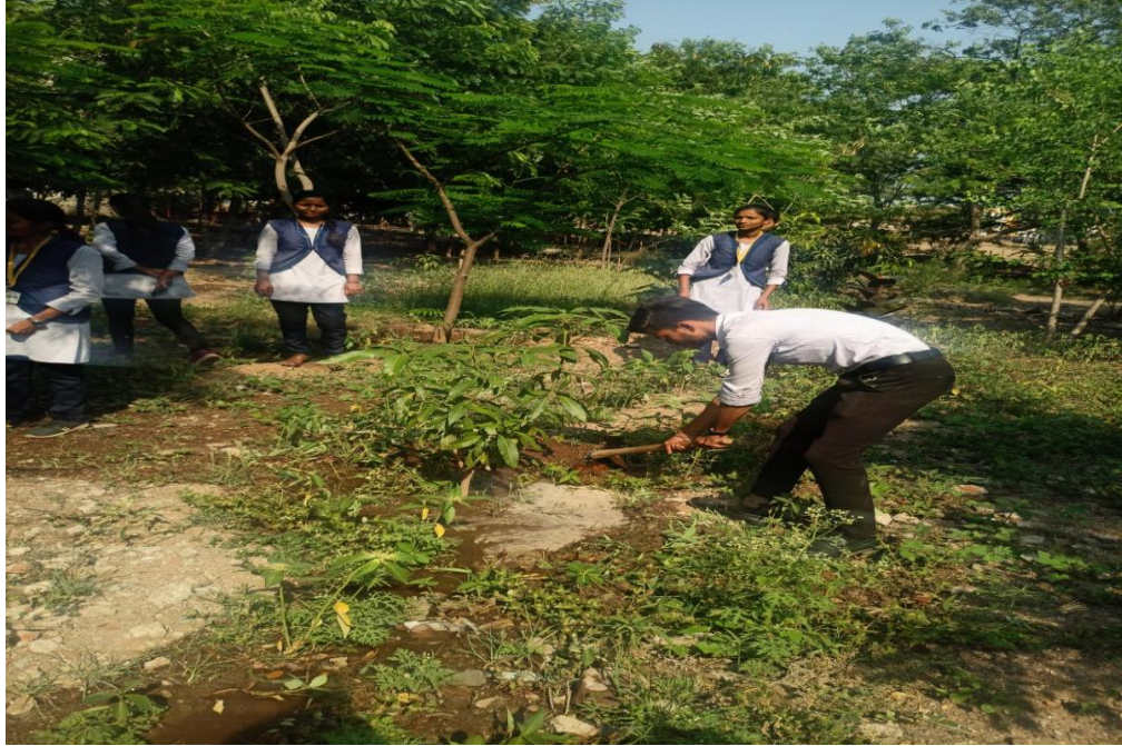
Maintenance in Botanical Garden