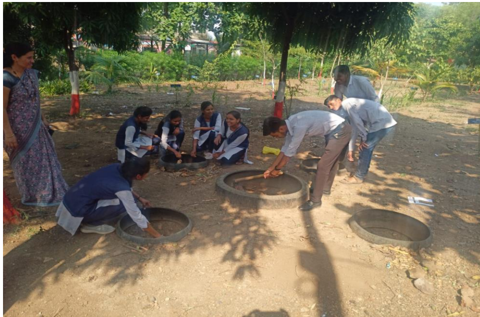
Preparation of Artificial ponds