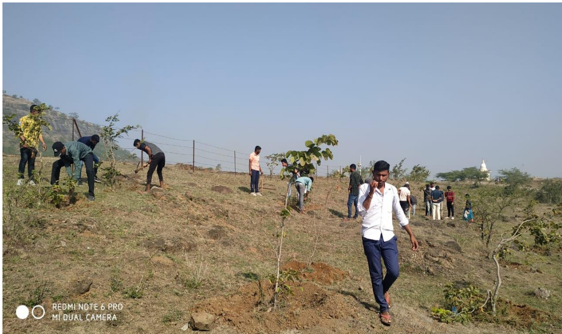
Plantation at Dubere under the Nature Club