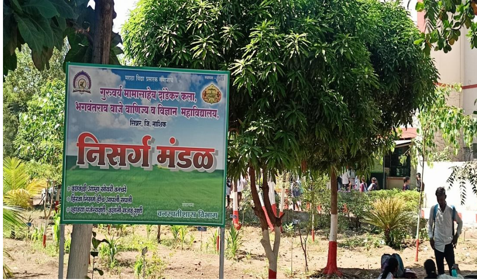
Nature Club board displayed