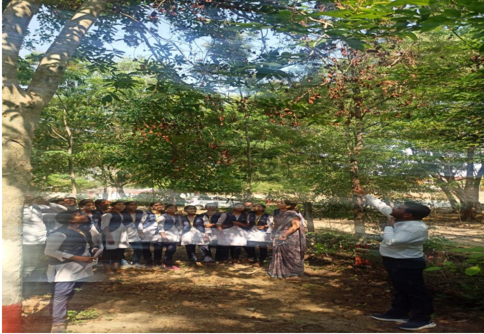
On field Study of Plants