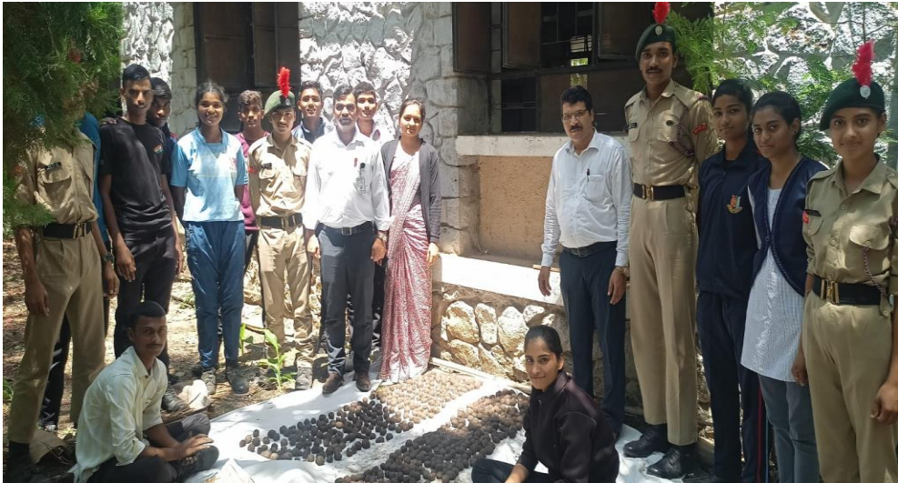
Departmental involvement in Seed ball preparation