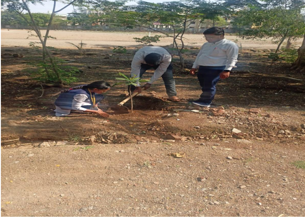
Plantation in Garden