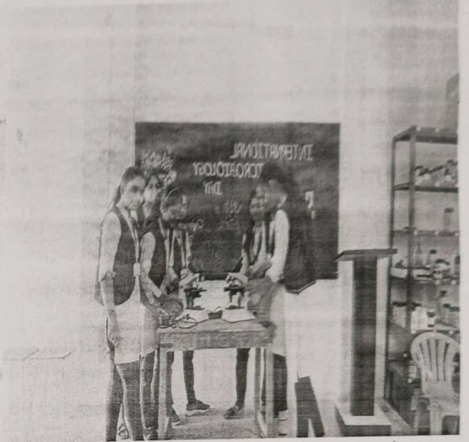
Students observed different types of microorganism