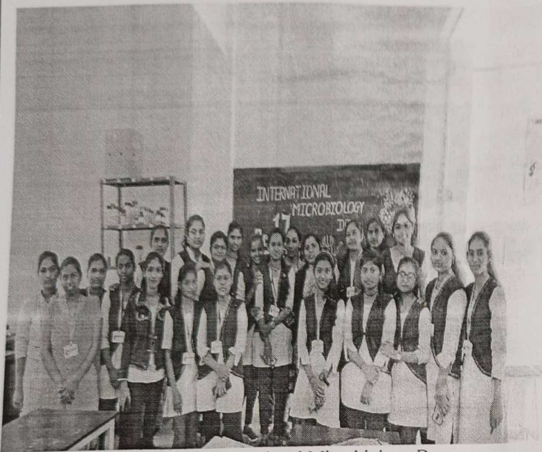
Students Celebrating the International Microbiology Day