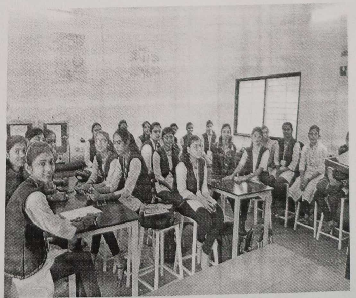
Students attended lecture of carrier Enhancement