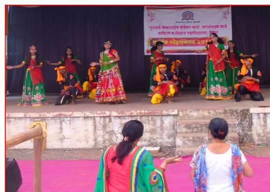
Disable Children from 'Gharkul' and 'Padsad' are provided stage to exhibit their talent