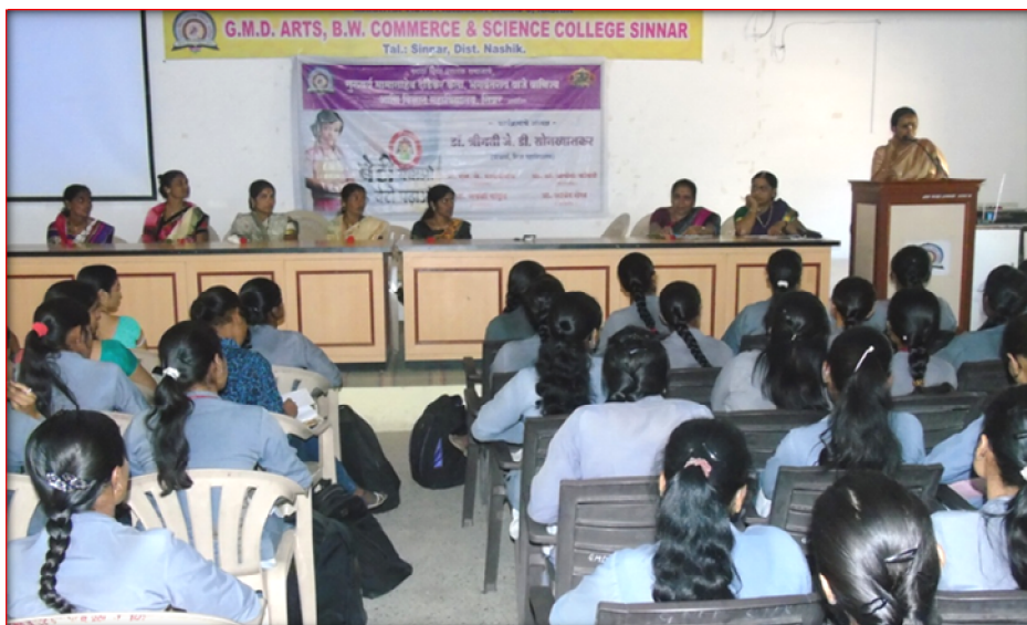
Orientation Program for Girls on 'Kali Umaltana...'