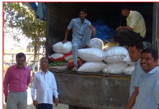
Handling over Grains to Gharkul Parivar Sanstha, Nashik