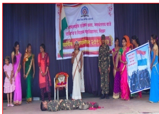
Ek Din Shahido Ke Naam: Cultural Program