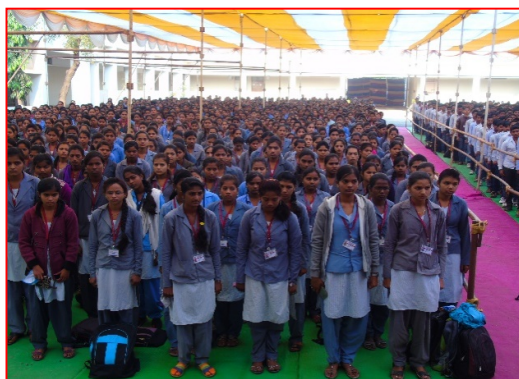
Paying Tribute to Soldiers