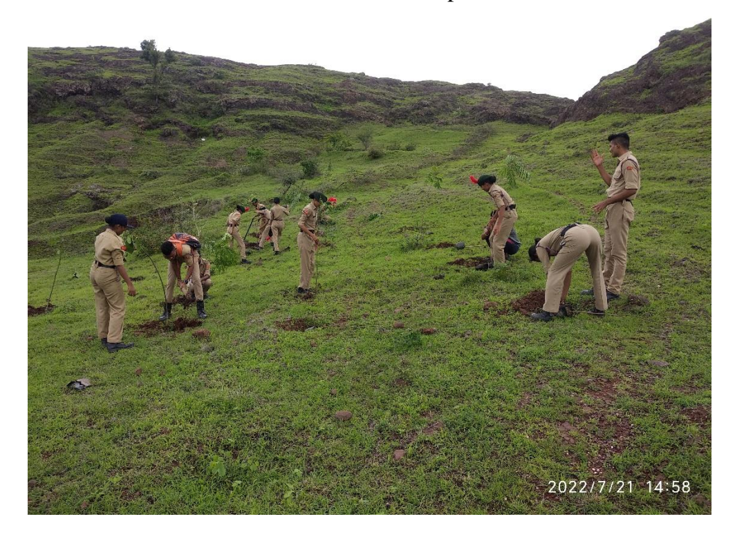
Plantation at Shahid Smarak, Sabarwadi