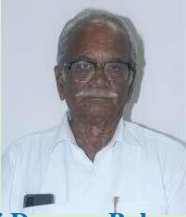
Hon. Shri. Deoram Baburao Mogal Upsabhapati