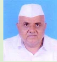
Hon. Shri. Dilip Sakharam Dalvi Chitnis