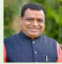
Hon. Shri. Balasaheb Ramnath Kshirsagar Sabhapati