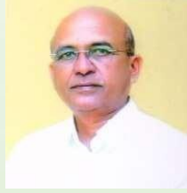
Hon. Shri. Vishwasrao Bapuro More Vice-President