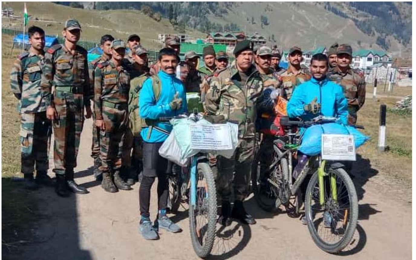
INDIAN ARMY OFFICERS and soldiers support them in the bicycle journey.