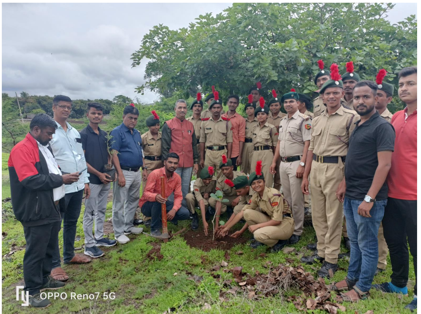
Plantation at Dubere village