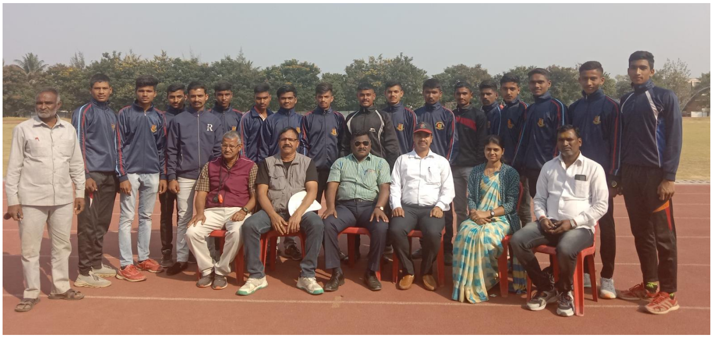
NCC Cadets at the MEENATAI THAKARE stadium at the time of district level matches.