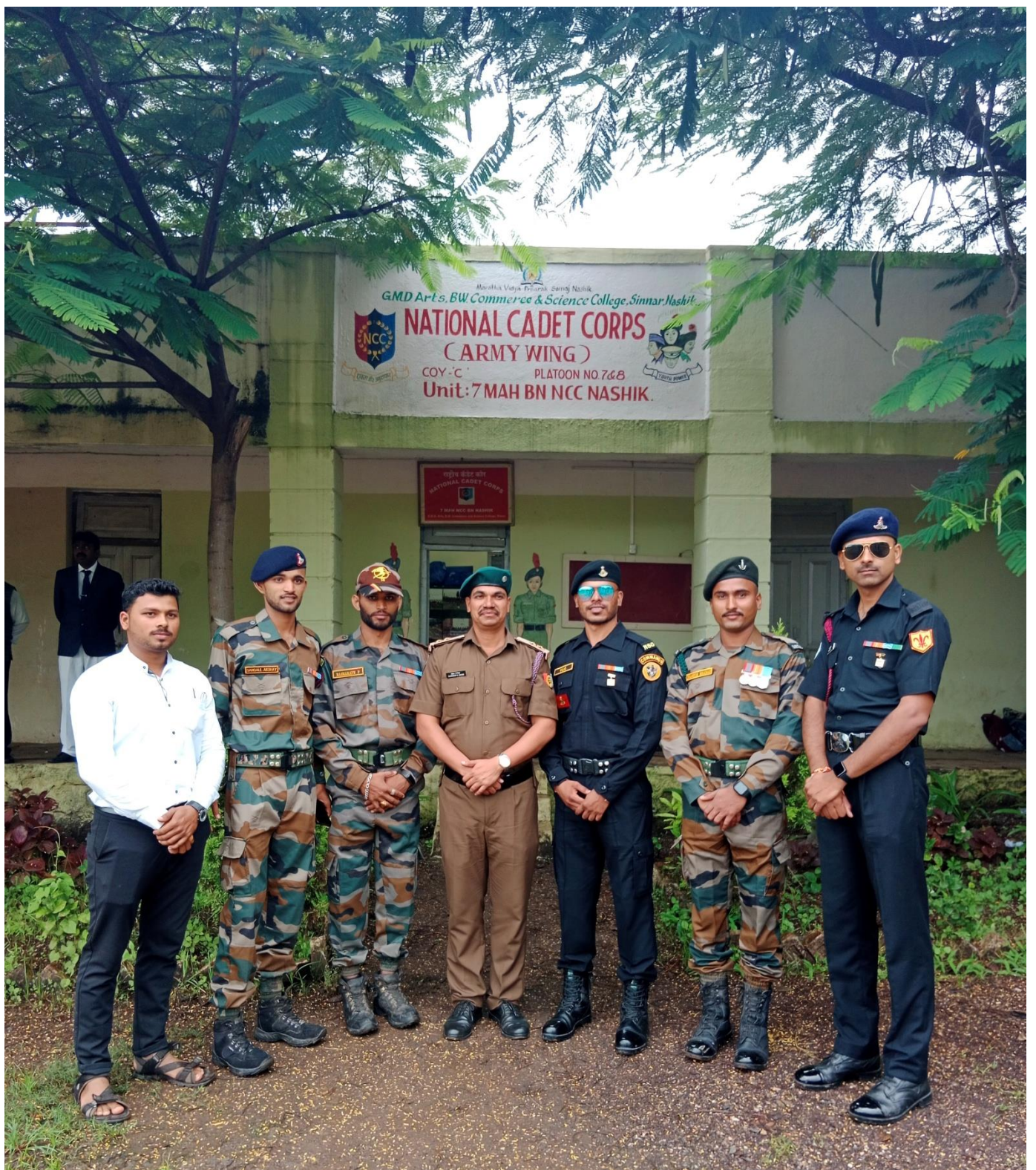
EX CADETS: SOLDIERS IN THE ARMY VISIT TO NCC OFFICE ON 15 AUG 2022