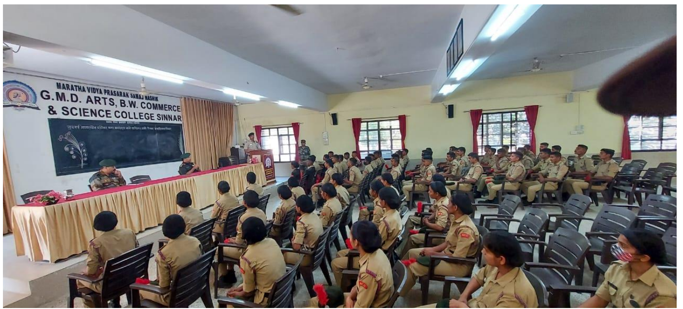
Interactions of CO and AO with NCC cadets