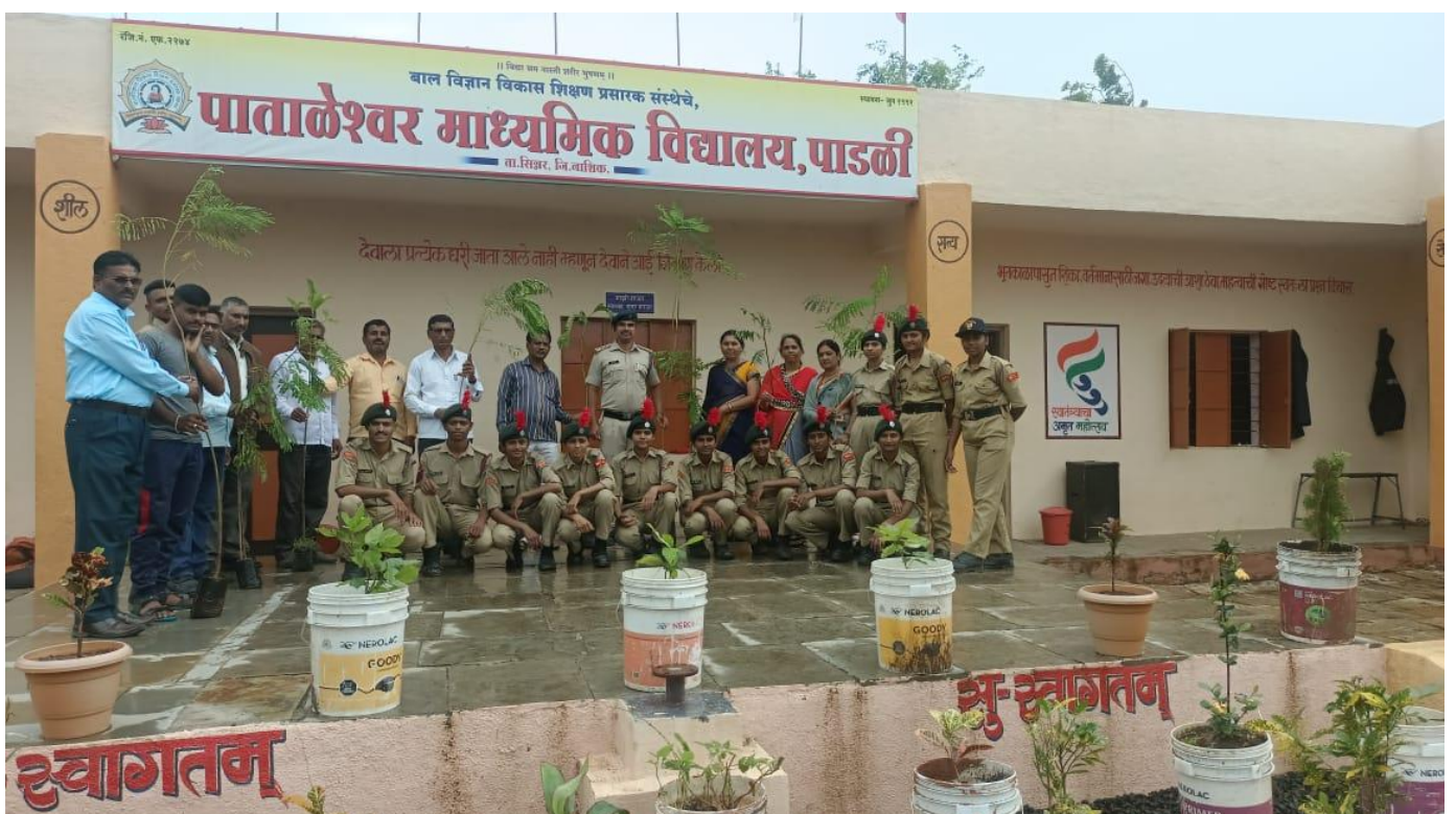
PLANTATION : AT PADALI, POST - THANGAON