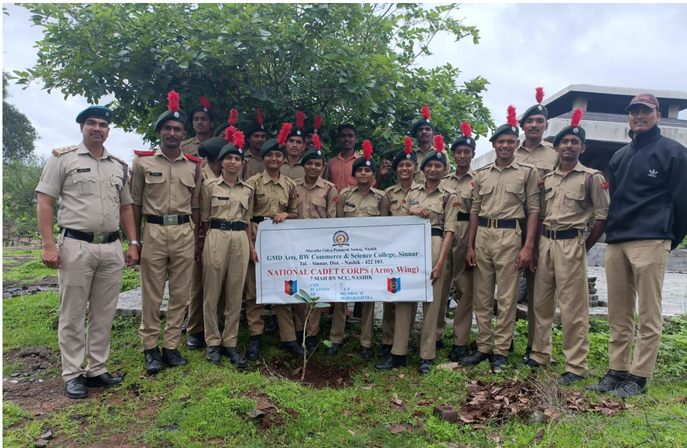
PLANTATION DONE AT DUBERE