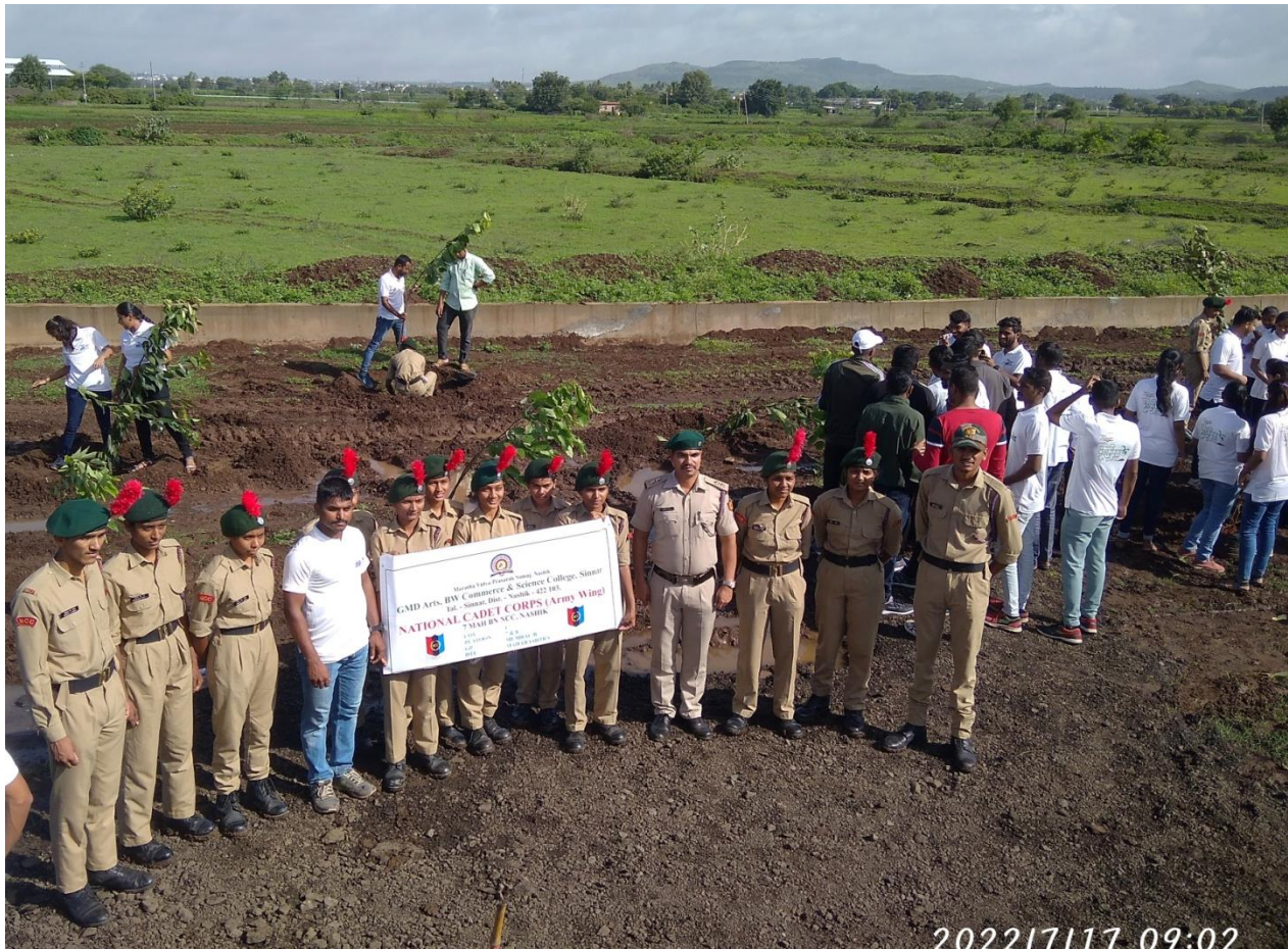
PLANTATION AT SINNAR –SHIRDI BYPASS