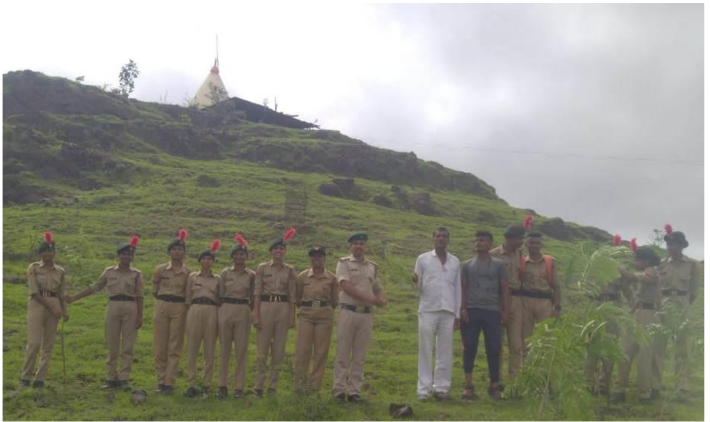
PLANTATION on Mahadev Hill at ASHAPUR