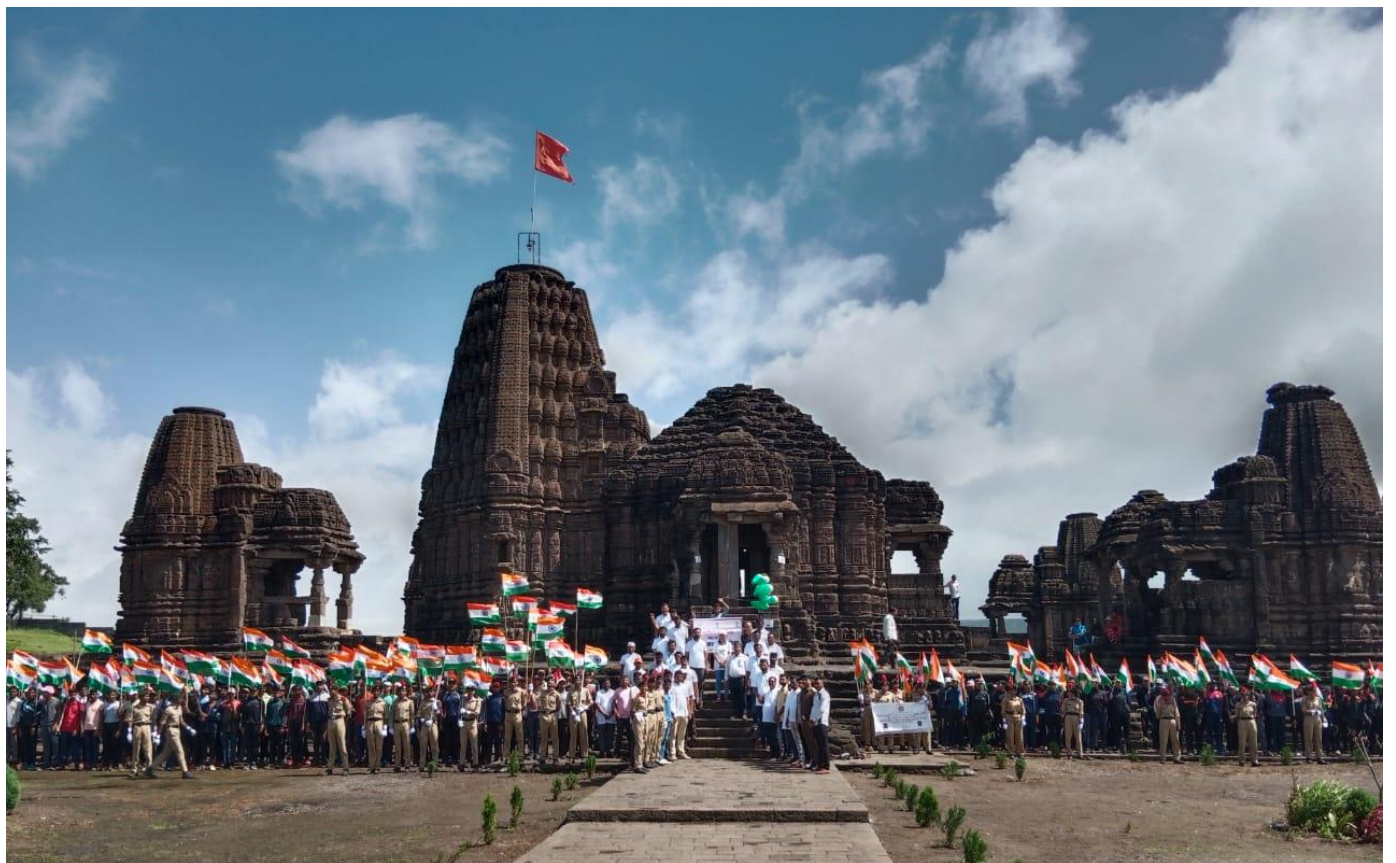
HAR GHAR TIRANGA CAMPAIGN, RALLY and HERITAGE WALK at the GONDESHWAR TEMPLE, SINNAR