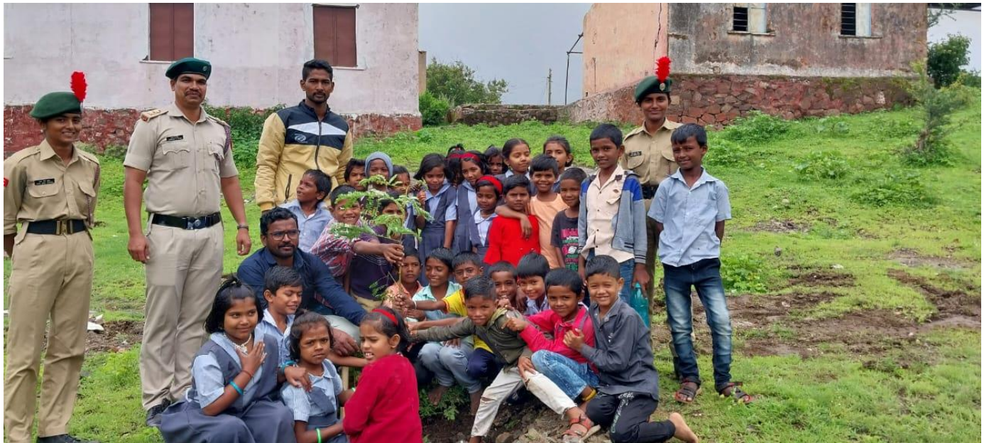
PLANTATION AT DUBEREWADI WITH SCHOOL CHILDREN