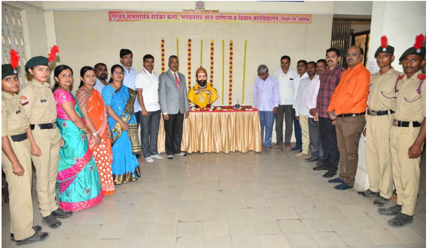
CELEBRATION OF SHIV RAJYABHISHEK DIN 6 JUN 2022