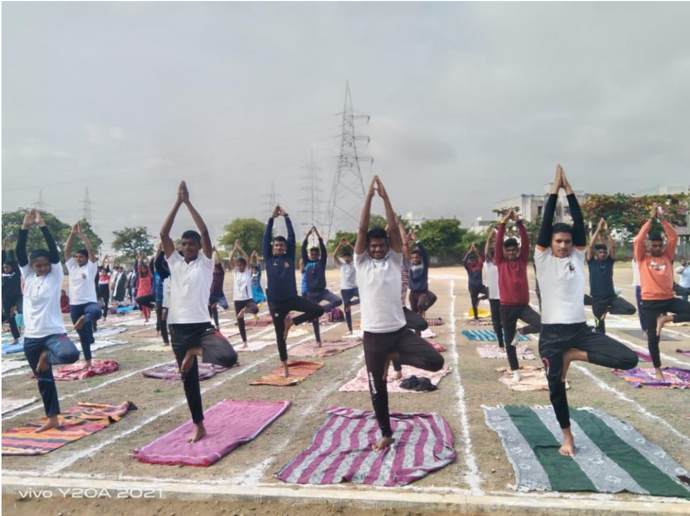
INTERNATIONAL DAY OF YOGA 21 JUN 2022