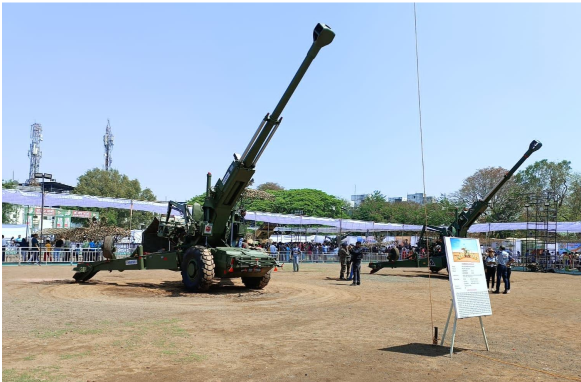
Participated cadets in the KNOW YOUR ARMY: ARTILLERY EXHIBITION