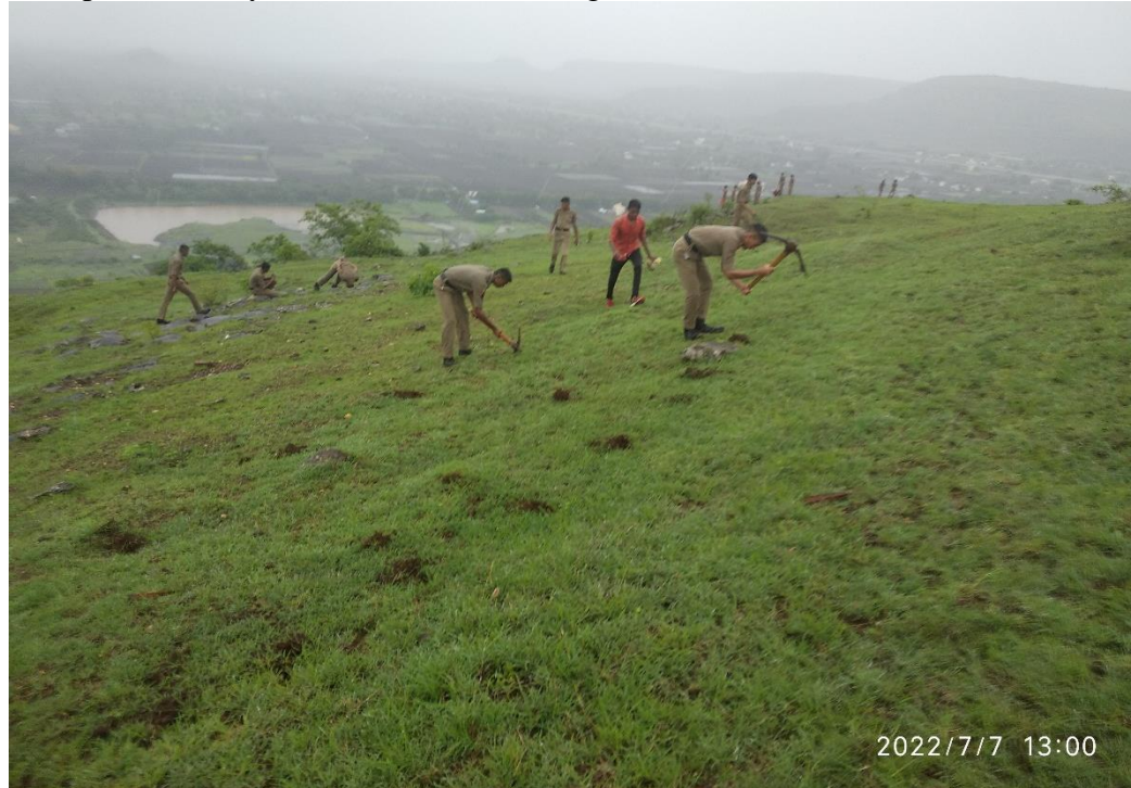
Plantation done with villagers by NCC cadets

Seed balls plantation by NCC cadets at Duberegarh hill 07 JUL 2022