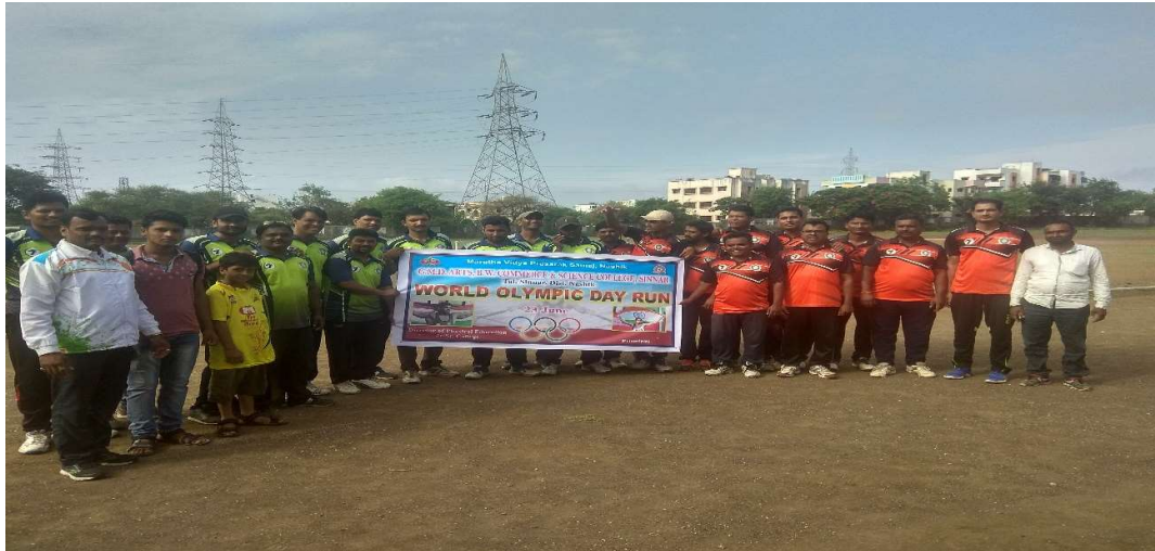
(World Olympic day Run)