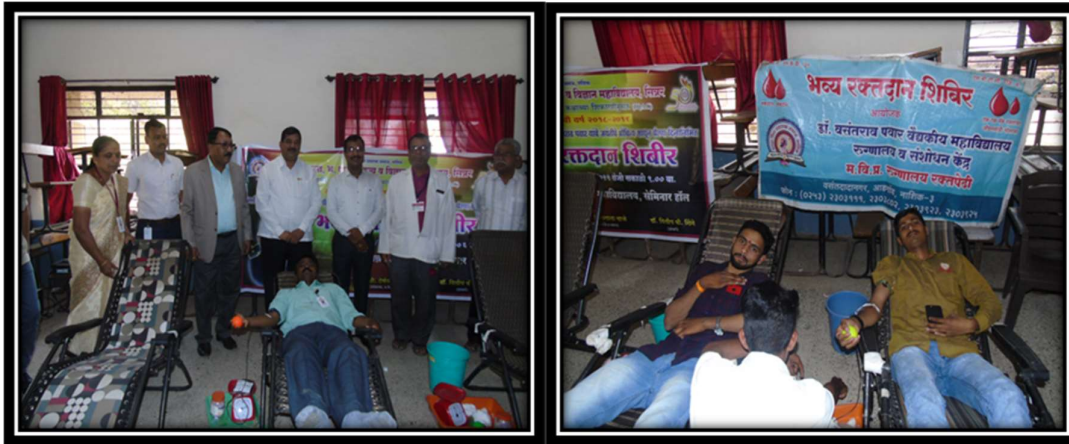
(Photographs of blood donation camp organised on occasion of Sport day)

Director of Physical Education G.M.D. Arts, B.W. Commerce & Science College, Sinnar