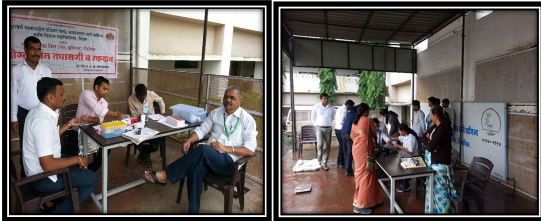
( photographs of blood donation camp organised on occasion of Sport day)

Director of Physical Education G.M.D. Arts, B.W. Commerce & Science College, Sinnar