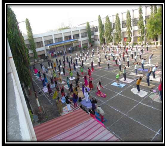
(GMD, Arts BW, Commerce & Science College Organised Yoga Day)