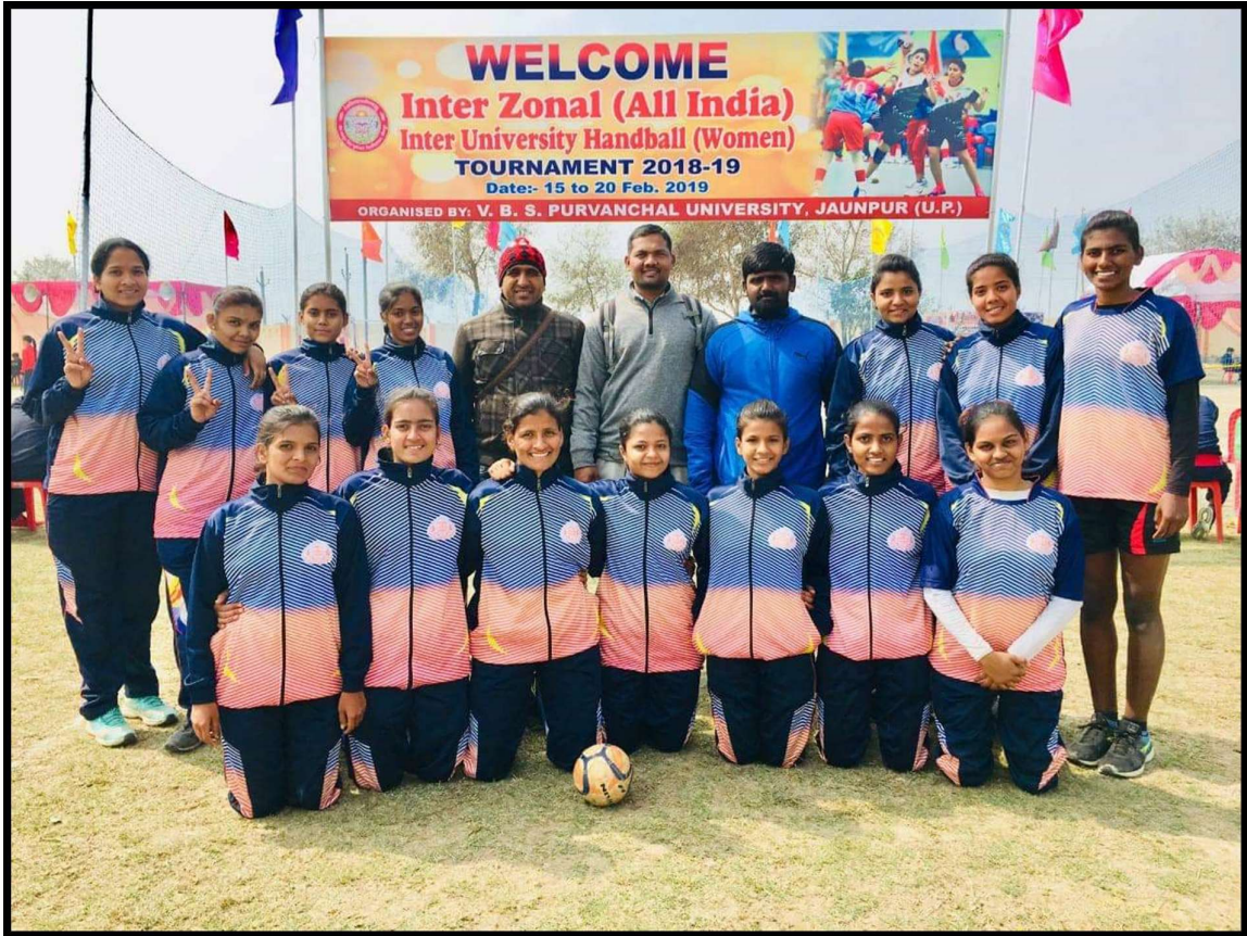
(Interzonal Handball Women team Winner)