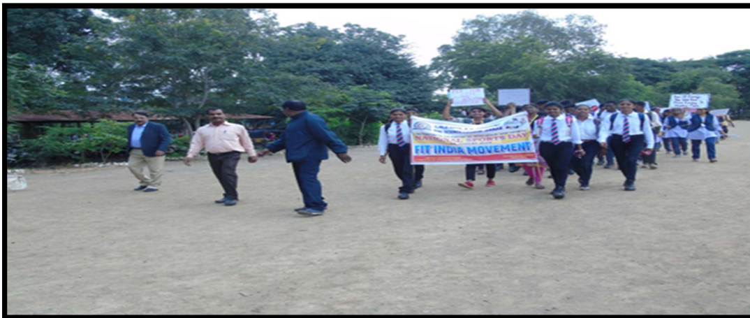
(GMD, Arts BW, Commerce & Science College Organised Fit India Rally)