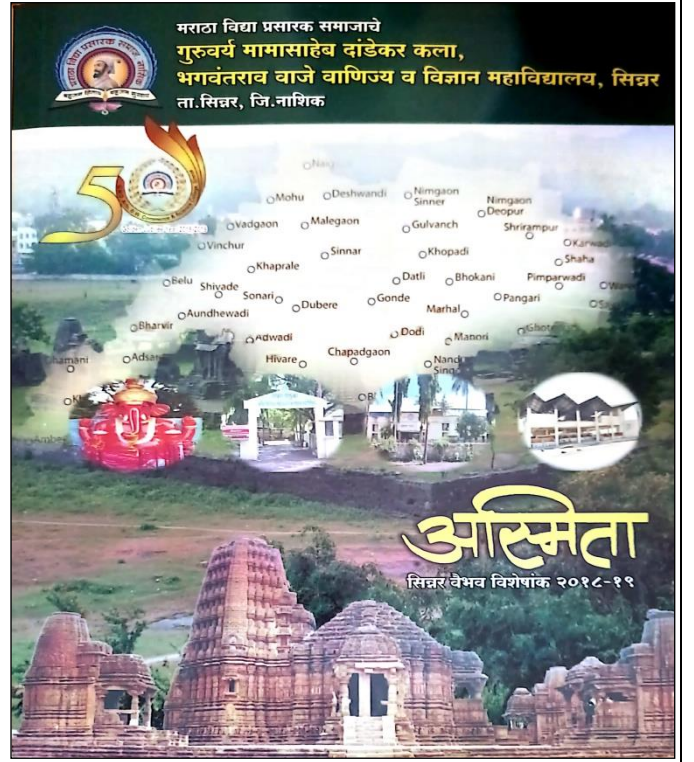
Sinnar Vaibhav Visheshank