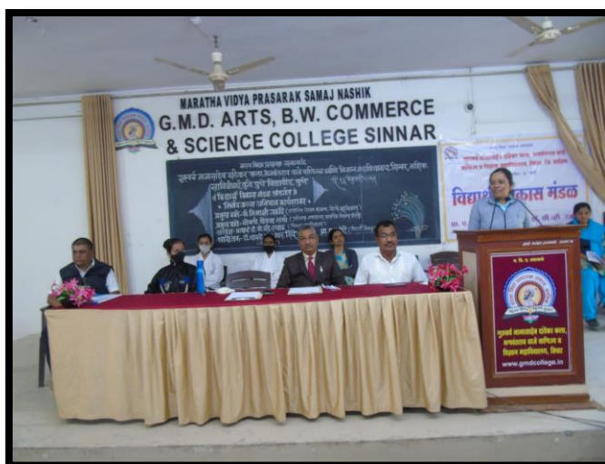
photo of Event/ Programme